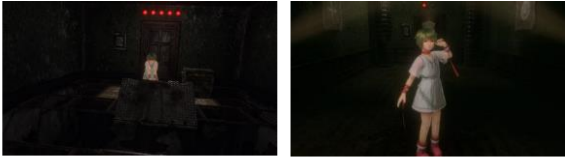
*Images were taken during development. May differ from the final product.